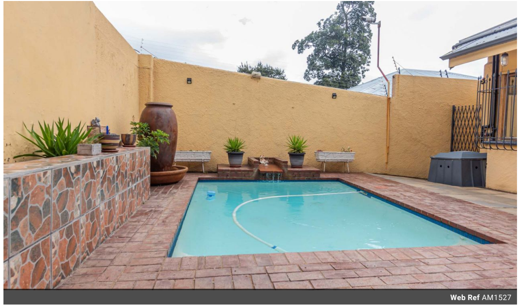
Web Ref AM1527