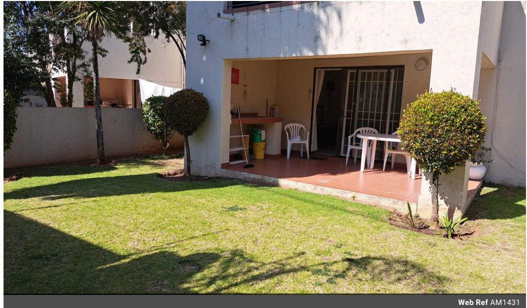
Web Ref AM1431