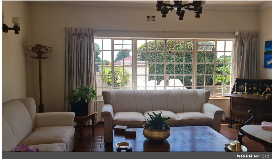
Web Ref AM1512